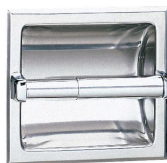
B-6677 Satin Finish

Rough Opening 5-1/2" (140mm) wide 5-1/4" (135mm) high 3-3/8" (85mm) minimum recessed depth