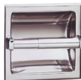
B-667 Bright Polished Finish